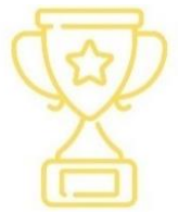
House Point Winners

Congratulations to our Term 4 house point winners Eagles who are invited to wear their own clothes to school on Friday 1 st May '26.